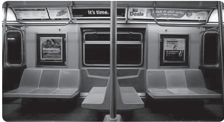
from Samples of Society by Hal Samples